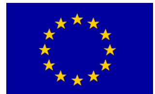
European Commission DG Transport & Energy