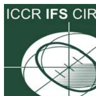
The Interdisciplinary Centre for Comparative Research in the Social Sciences